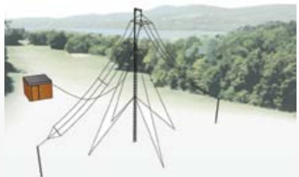
Inverted “V” configuration